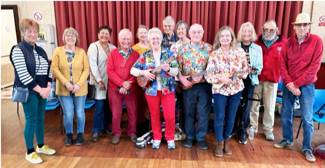
Above: The Ukulele Group at their concert in May at the Prestwood Village Hall. The audience were provided with song sheets and sang along happily.